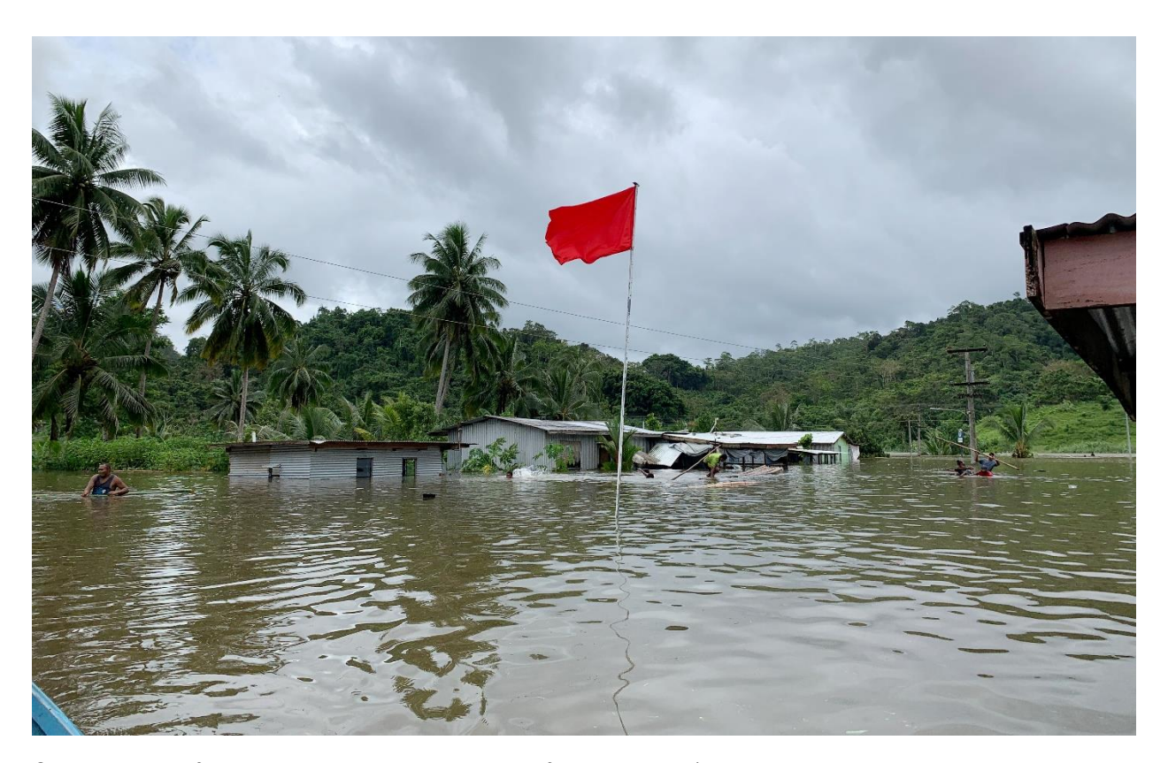
Caption: A red flag had been raised by villagers of Wailotua No.1 in Wainibuka, Tailevu to indicate that they were in danger from the floods brought about by TC Cody.